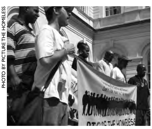
Picture the Homeless members protest on the steps of New York's City Hall.

Food AND Medicine began in 2001 as an alliance of laid-off workers, union